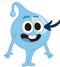
Eyes are watching